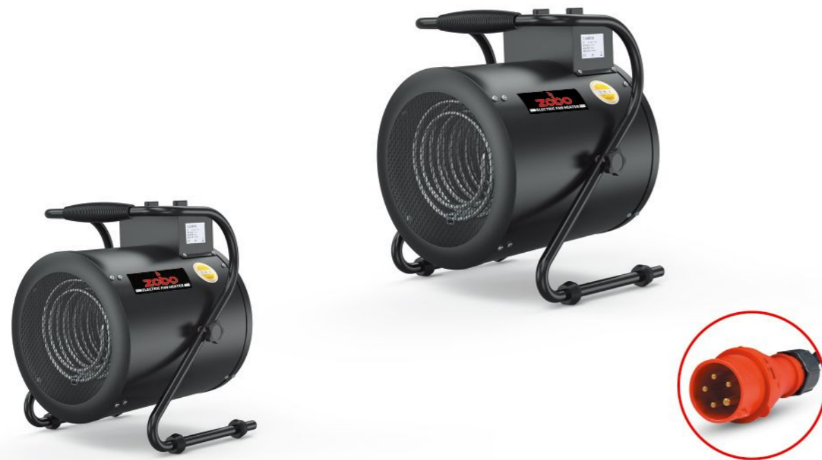
Optional: 380V industrial plug